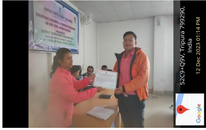
Participant receiving certificate of the Programme.

Student from the Participants giving feedback.