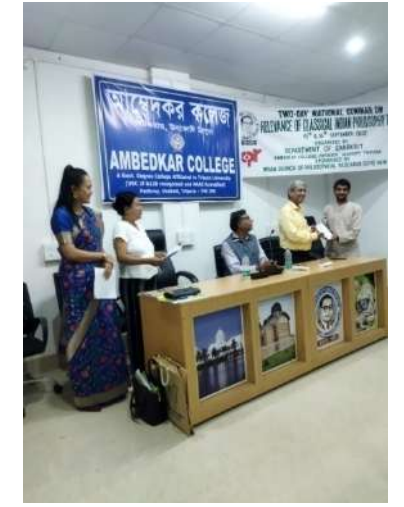
Paper presenters attended the first technical session