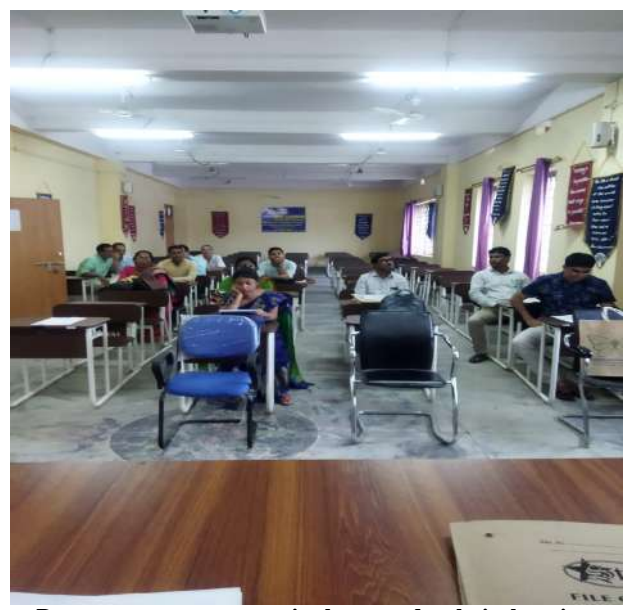
Paper presenters present in the second technical session