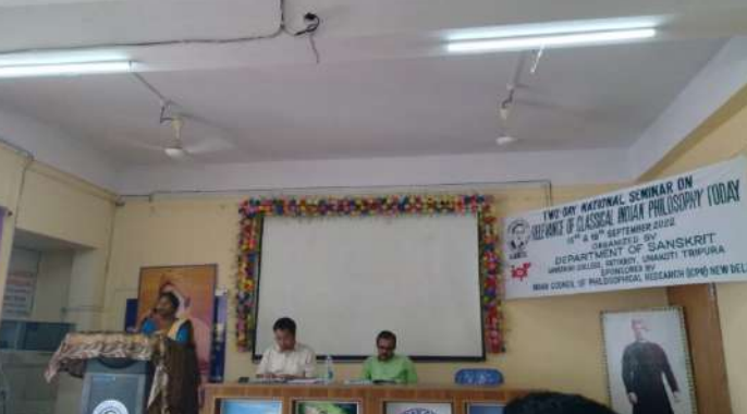
Scholars\ presenting\ their\ research\ papers\ in\ the\ fourth\ technical\ session\ in\ the\ seminar\ hall