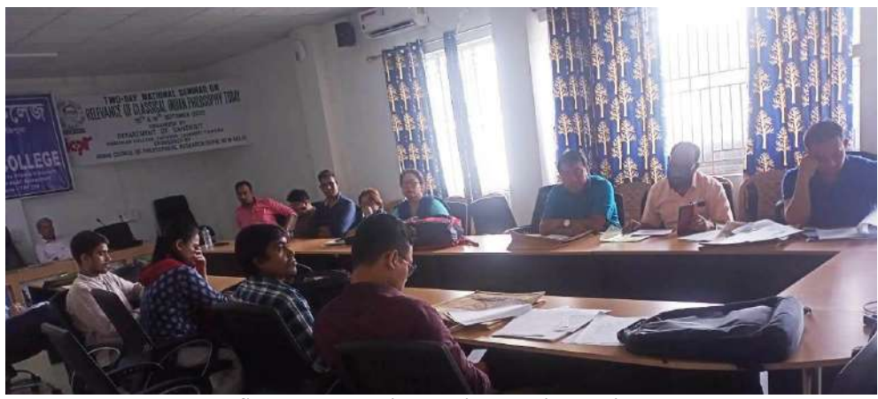
Scholars present in the third technical session