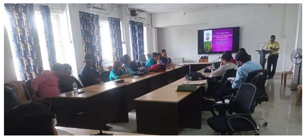
Scholar presenting research paper in the third technical session