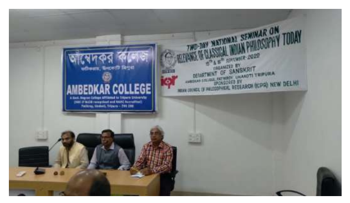
Plenary session in the E-study centre