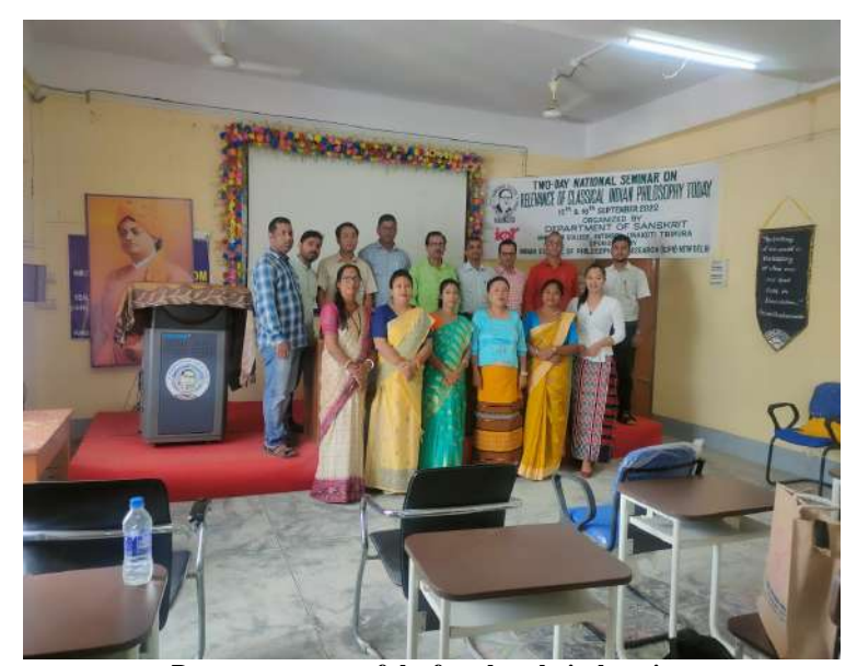
Paper presenters of the fourth technical session

After these two sessions all guests and participants headed for lunch.