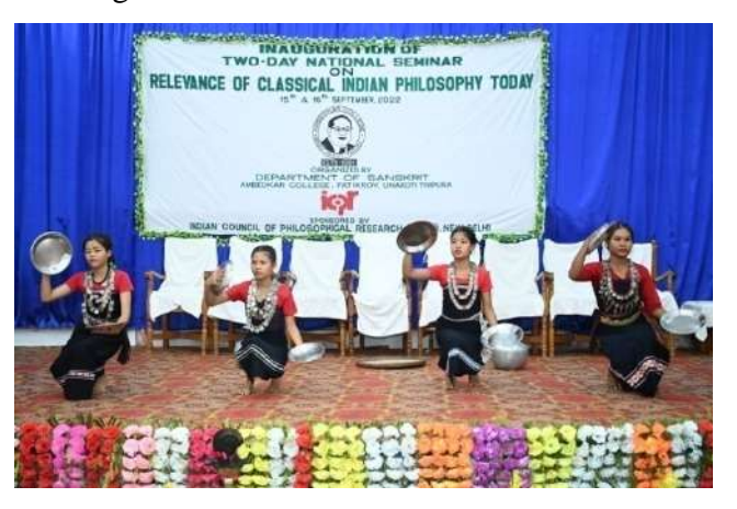
Students performing hojagiri dance

The inaugural session comes to an end with the Hojagiri dance, traditional dance of Reang tribes of Tripura, performed by the students of the college.