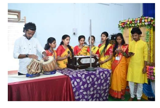
Students singing the welcome song

learned audience. On this occasion the welcome song was sung by the students of the college.