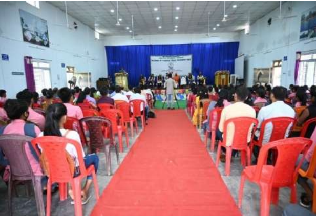
Audience present in the inaugural session of the national seminar