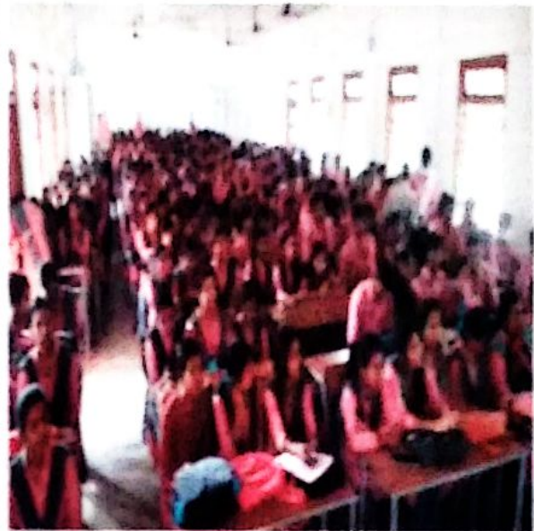
Glimpse of the programme held on 24 th November 2021 at room no 5, Old Academic Building.